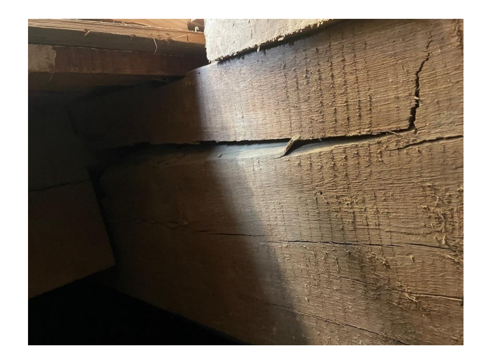
View the cracked fireplace header, which supports three levels of brick masonry.