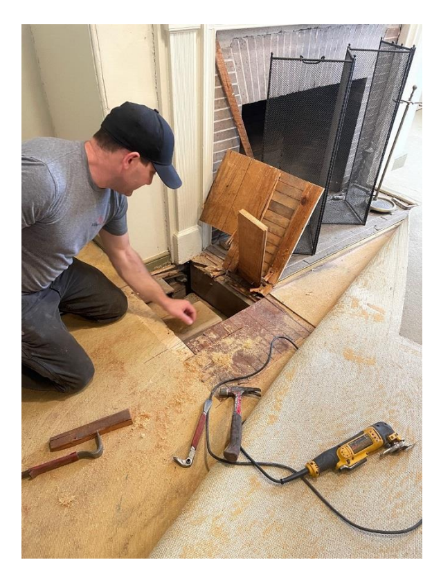
Removal of flooring in southwest parlor to investigate the condition of the fireplace supports.